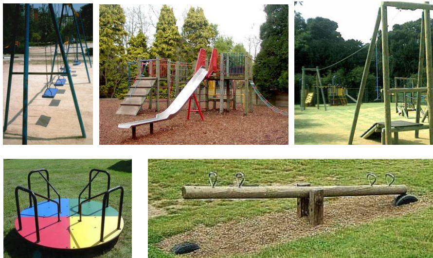
Figure 1 Play equipment commonly found in UK playgrounds. (Clockwise from top left) Swings, slide, zip-wire, roundabout, see-saw.

Given the authors previous work on playful technologies which sensed the responses of participants (see section 1), this session began with a talk by an expert, who described a broad range of available sensing technologies, and motivated their use. Participants were then reformed into different groups, and each was given a single type of ride to work on. Participants were then asked to design a novel ride which was inspired by this, but which integrated electronic sensing technologies in some form. For this activity, participants were explicitly told that they could think beyond the boundaries of the playground, and were provided with a selection of materials to construct models of their designs from. As before, group presentations were video-recorded, and photographs of all models constructed by participants were taken. Participants were then given the opportunity to talk about any thoughts that they had in relation to the workshop, which concluded after this session.