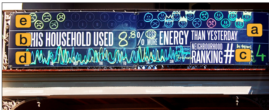
Figure 2. Overview of the graphical depictions on the public feedback display: Marginal Notes (a), Daily Performances (b), Neighborhood Ranking (c), Historical Graph (d), Pictorial Bar (e).

f. Private Display . Households were also provided with a common electricity monitor, embedded in a custom-made blackboard (Figure 5, Right). We decided on giving explicit access to the monitor device in order to entice the trust that the information shown on the public display was based on continuous and accurate measurements. The small, custom-made blackboard aimed to encourage participants to take notes about appliance usage or other energy-related observations, similar to keeping a journal, which can support self-reflection and in turn, the discovery of intrinsic factors of motivation [24]. The private display was pre-printed with weekday abbreviations to accentuate the daily update cycles embodied by the public display.