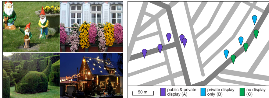
Figure 1. Left: Existing forms of social competition in the semi-public domain of the house façade and front garden. Right: A neighborhood map highlighting the participating households.

information, such as game scores, supermarket prices, or the water temperature in the public swimming pool. Even more, we expected that the manual act of updating a chalkboard could open up the opportunity for people to casually interact with the writer, so that a ‘data update’ has the potential to grow into a true ‘social event’, contrasting the unnoticeable millisecond blip of an electronic display.