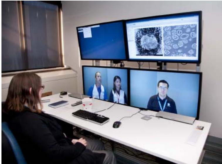
Figure 1 The integrated communication and collaboration platform at Australian Animal Health Laboratory (AAHL).

“shared workspace” was reviewed by three design representatives from AAHL and two experts from the national biosecurity authority. This feedback of the expert users were taken into account before the platform was finalised, developed and commissioned. After the introduction of the platform and training to the AAHL staff, a user study was conducted to capture the early adoption feedback from users (see section 5).