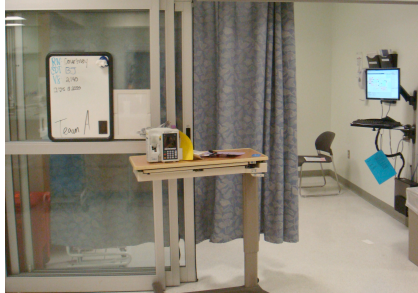
Figure 3. The whiteboard hung outside each patient room. It shows the room nurse belongs to "Team A"

Helping with the room nurses' temporarily heavy workload is theoretically one of the daily duties of the float nurse. However, situations wherein the room nurse is physically present but is unable to give the needed attention to a patient tend to be urgent, and though the float nurse could be called, there probably would not be enough time for the necessary patient information to pass from the room nurse to the float nurse. In a new strategy developed by nurses at our field site called "team nursing," nurses cover locally for each other in cases such as these.