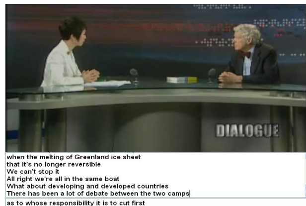
Fig. 1. An interface example of the experiment design.

Figure 1 showed an example of the interface developed for the experiment. Transcripts were displayed in a streaming mode, appearing letter by letter from bottom left to right. This display mode is necessary in real-time scenarios as the speakers’ words cannot be foreseen before being spoken.