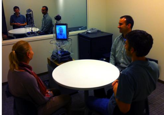
Fig. 1. The experimental setup, showing three collocated participants and the kinetic proxy seated around a table. The proxy was operated by a confederate, and positioned so that its swiveling display approximately matched participant eye-height.

We are particularly interested in videoconferencing systems to support hub-and-satellite meetings, where most participants are collocated except for one participant at a satellite location. This satellite is represented in the collocated space by a proxy device consisting of a display screen, camera, speaker, and microphone (Fig. 1). The satellite perceives the hub location through streams of audio and video displayed on his computer display.