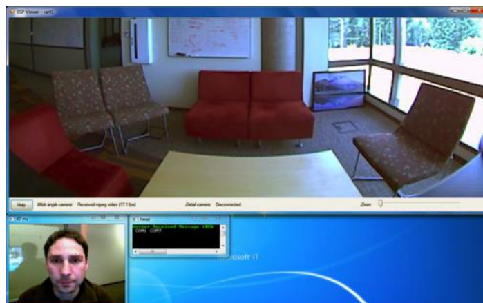
Fig. 3. View of the satellite’s interface. At the top is the view coming from the fixed wide-angle camera. The lower left window provides feedback of the image the satellite is projecting on his or her proxy. It also provides feedback that the head-tracker has a good representational model of the satellite’s head.

All audio and video communication was over wired and wireless LAN, while the position control stream for controlling the motion of the proxy was carried by USB cable between the two rooms.