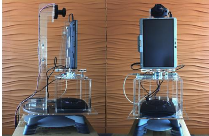
Fig. 2. Side and front views of the kinetic proxy. At its top is a fixed-position wide-angle video camera. Below the camera is a 12” tablet PC, which shows video of the satellite participant. The tablet is mounted atop a remotely-operated turntable which, in turn, is mounted atop a hutch that holds a videoconference speakerphone.

The proxy also included a fixed-position Axis 212 wide-angle camera. The view from this camera was displayed across the entire width of the satellite’s 30” monitor (see Fig. 3). This configuration allowed the satellite to see all of the hub participants and their positions around the table, as well as the top edge of the Tablet PC, to confirm that it was oriented as she expected. The satellite’s screen also displayed the video directly from the tablet’s integrated webcam, but the confederate preferred to focus on the larger, wide-screen image, both to more directly engage the hub individuals and because it provided sufficient feedback of the screen’s orientation.