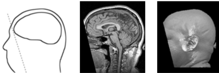
Fig. 2. Quickshear Defacing illustrated (left). Sample slice (middle) and volume rendering (right) after defacing.

Quickshear Defacing is a new technique for removing facial features from structural MRI. The primary objective is to provide an efficient and effective defacing mechanism that does not rely on external atlases. It uses a binary mask to identify the brain area to protect, as illustrated in Fig. 2. It identifies a plane that divides the volume into two parts: one containing the brain volume and another containing facial features. The voxels that fall into the latter volume \mathbf{F} are removed, leaving the brain volume \mathbf{B} untouched. Removing all facial features is not necessary to de-identify the image, and the subject’s identity can sufficiently be obscured by removing the primary features (eyes, nose, mouth).