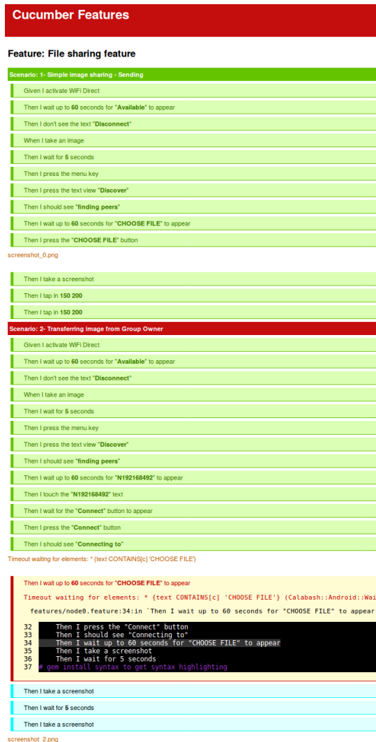
Fig. 4: Testing results screenshot

Calabash with a different purpose: to support testing of peer-to-peer communications.