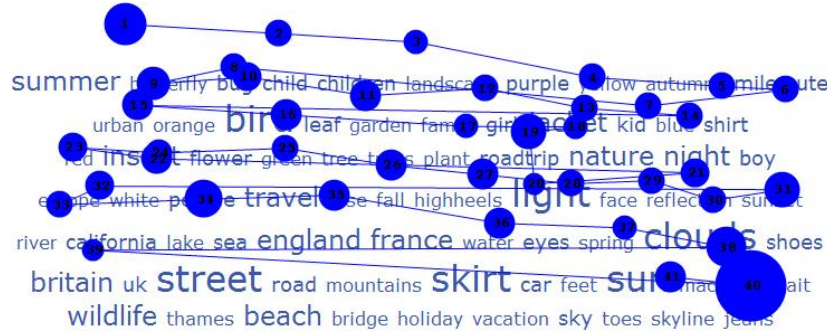
Fig. 6. Gaze plot for serial search using zigzag pattern (semantic layout); note the upward dislocation of the gaze plot due to unsystematic head motor activity of the participant

Focusing on performance in different layouts, research on the perception of alphabetically ordered tag clouds showed that search processing becomes much more targeted once the user recognizes this principle of organization (see Fig. 4) [Kaser2007], [Schrammel2009b]. An example is shown in Figure 5 where the gaze heads first to a very large tag at the bottom of the cloud. Scanning inverse to reading direction is then initiated until the alphabetic order is recognized. Eye movements turn to the region where the target tag is estimated, following the perceived principle of organisation.