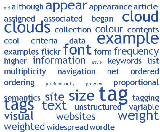
Fig. 1. Example from a TagCrowd 1 tag cloud

to accurately organize relevant data. These user-generated tags can then be embedded into a graphical frame, i.e. a tag cloud within the users personal profile. A tag cloud can also serve as a categorization method for special content items where the font size of each tag reflects the quantity of subsequent content items in a given category. Keeping in mind these different tasks where tag clouds can be involved, user-related factors such as individual skills and familiarity with this kind of tool will always have an impact on the resulting performance during an interaction. It is therefore important to consider that different search scenarios exist, originating from personal search intentions in various search contexts. Different browsing contexts depend on the goals and intentions of the users, which lead to different browsing behaviors. We will discuss the significance of these scenarios later in this work.