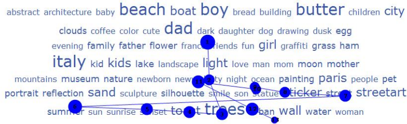
Fig. 4. Targeted search behavior for the target tag "water" (alphabetic layout)

Tag clouds with semantically clustered tag arrangements have been implemented by a series of research groups. Semantic relatedness is most often defined by the means of relative co-occurrence between tags (see section 4.1). Whereas some could determine a better search performance of their participants for the interaction with a semantically clustered tag cloud [Hassan-Montero2006], the results in our experiments did not show such an improving effect [Schrammel2009b]. Nevertheless the study showed that semantically clustered tag clouds can provide improvements over random layouts in specific search tasks. Also, semantically structured tag clouds were preferred by about half of the users for general search tasks, whereas tag cloud layout did not seem to influence the ability to remember tags.