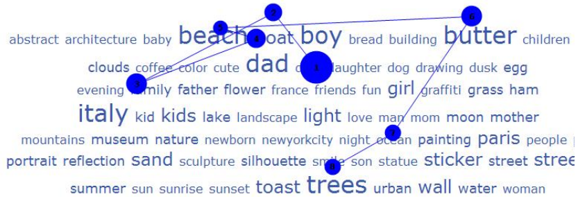
Fig. 3. Gaze plots showing fixations on tags with large font size

than the smaller ones, tags with small font size positioned in the bottom right quadrant risk being neglected by the users attention. This observation should be a principal motivator for conceptual adaptations in future design considerations.