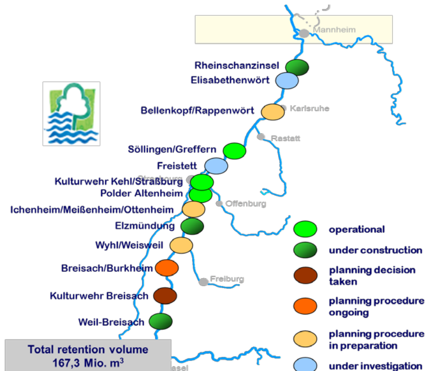
Fig. 1. Current status of measures and retention areas of the Integrated Rhine Programme