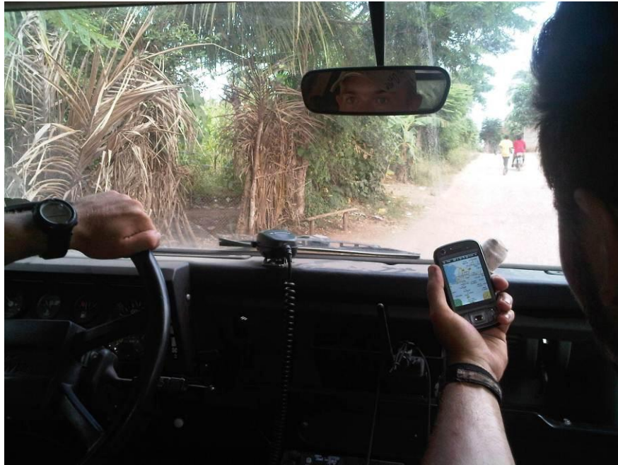
Fig. 2. Usage of GINA in Haiti by Hand for Help organization

documentation tool for rescuers and the results are again available online on www.japansituation.com [4].