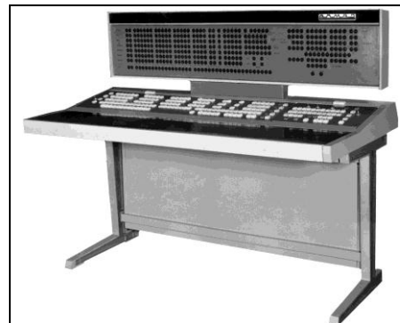
Figure 4. Super-computer “Almaz” engineering control console

Alongside with the application of modular arithmetic, they found one more architectural way to obtain substantial growth of the general productivity of the computer. This was the decision widely applied in later systems of processing of signals by the introduction of a system of the processor of preliminary processing a signal. Soon, it became a new word in a science and technique. Into structure of the “Almaz” computer, they used three types of computing processors.