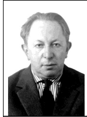
Figure 2. Israel Jakovlevich Akushsky

Between 1960 and 1963 in this department, the first modular super-computer in the country (the T-340A) was designed as an experimental model of the complicated system. (Here, a super-computer is understood as a computer with record-breaking high characteristics at that time). The theory and practice of variant modular arithmetic principles of construction of the computer was designed on this basis by I.J. Akushsky, D.I. Juditsky, and E.S. Andrianov. This computer had really worked for many years in the experimental system. The received results have been used in designing the K-340A computer, which has been mastered in a batch production and became the base for all systems designed in those years within NII DAR. In these computers, they released the principles of independent commands and data memory channels.