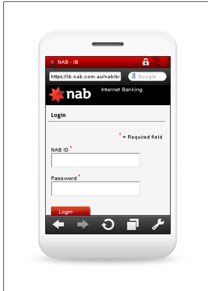
Fig. 2. Opera Mini Secure Connection ( http://www.opera.com/mobile/demo/ viewing NAB's secure logon page)