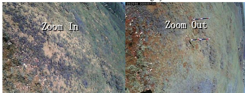
Fig. 2. The dynamic images obtained by the CDMA-based soil-quality monitoring system.

A Java applet program was installed in the remote server to download image from the network camera via HTTP every minute and stored in the remote server. In order to monitor more areas, the network camera has setup in two benchmark level for measuring height of plants and leaf area index (Fig. 2). The image processing results will be described by other papers and omitted in this paper. All accredited users can visit or manage the network camera modules and any clients can visit the real-time or historical images from website anywhere and anytime under Internet environment. Therefore, this network camera module with an enough-quality dynamic image requirement at low cost is suitable to the monitoring system.