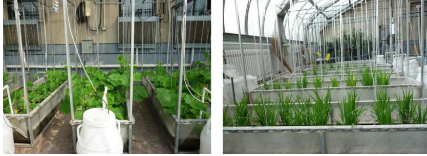
Fig. 1 The status of cucumber and rice cultivation.

from 2008 to 2009. Cucumber and rice seedlings were transplanted to 5 cultivation beds of the same dimension (250 cm × 60 cm × 40 cm), and 16 plants in each bed. A homogenous mixture of vermiculite, grass peat and perlite at a proportion of 3:1:1 was used as the cultivation base. The temperature and light intensity in greenhouse were optimally controlled through pad and fan cooling system and sunshade screen.