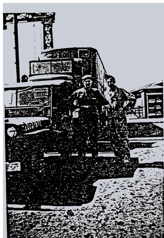
Fig. 3. One of the two lorries containing the so-called army machines brought back to Copenhagen from the U.S. Army in Germany. Parts of the machines were later installed in the City of Copenhagen's Bureau of Statistics, while the remaining parts were used at the Service Bureau [4].