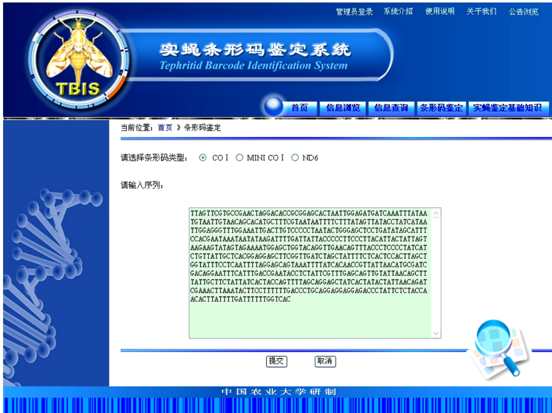
Fig. 3. The identification based on DNA barcode page of TBIS