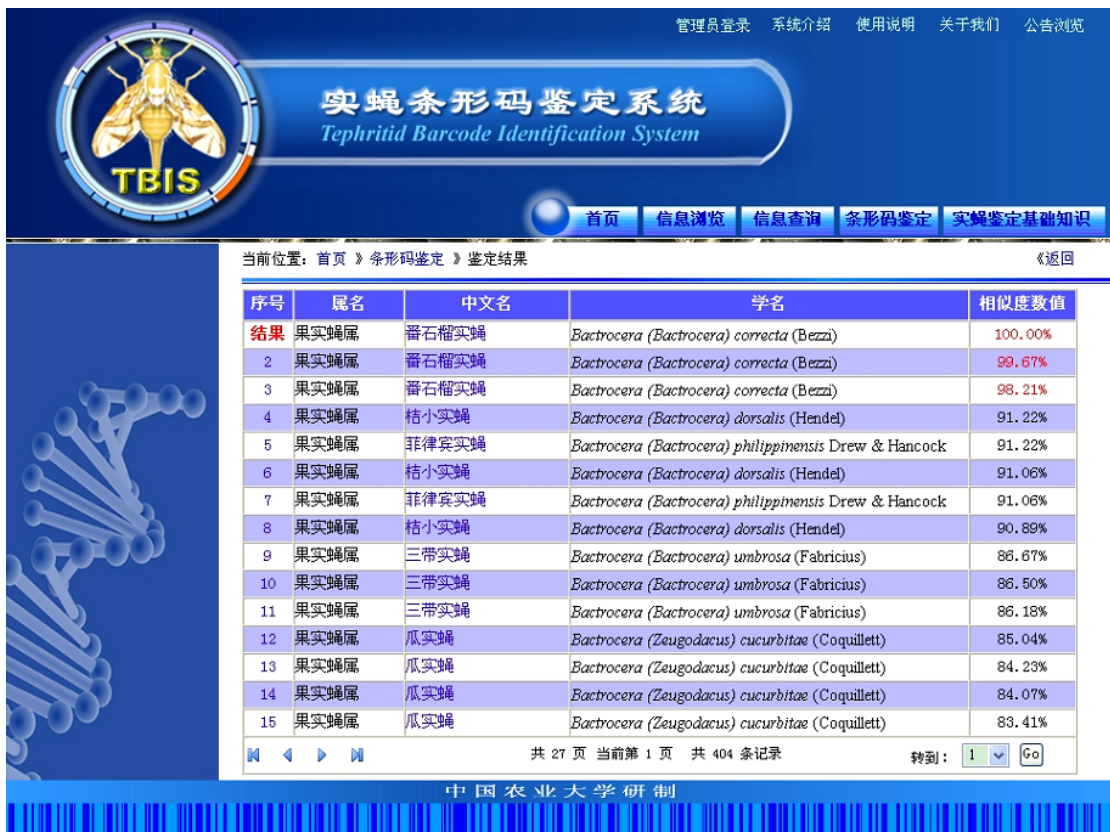
Fig. 4. The identification result page of TBIS