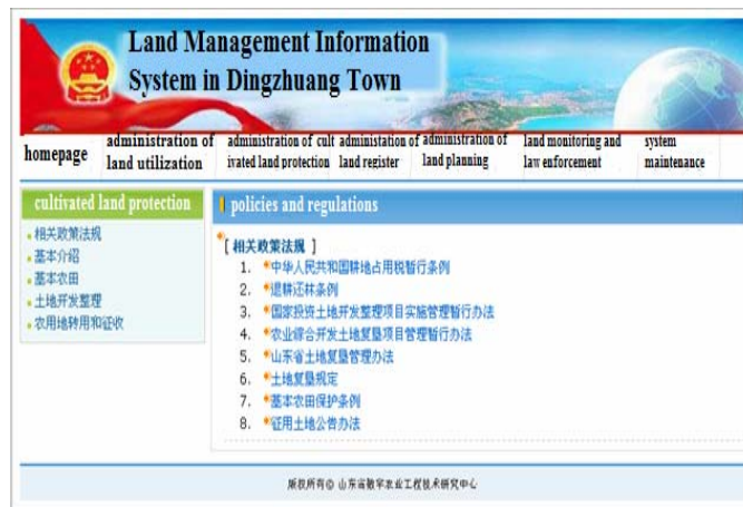
Fig. 3. Farmland protection interface