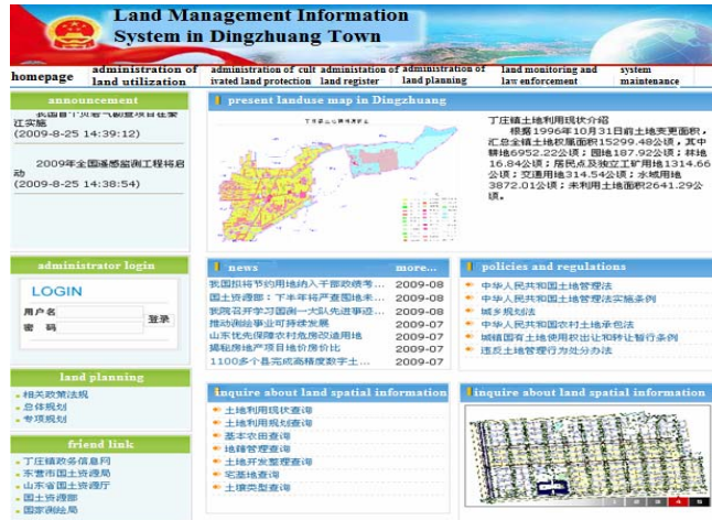
Fig. 2. Host interface of the system

This spatial information inquiry function contains four modules: layer demonstration; Hawkeye; attribute inquiry; inquiry outcome demonstration. In addition, there are other human-friendly functions like enlargement, shrinking, measurement, whole layer demonstration and so on. The first feature is that the users can inquire all kinds of land data information by clicking graphs, such as land plot basic information, land conversion information, basic geographic information and so on. The second feature is that users can inquire spatial graphic information by inputting conditions and also make inquiries by selecting land categories, the administration it belongs to and administrative region.