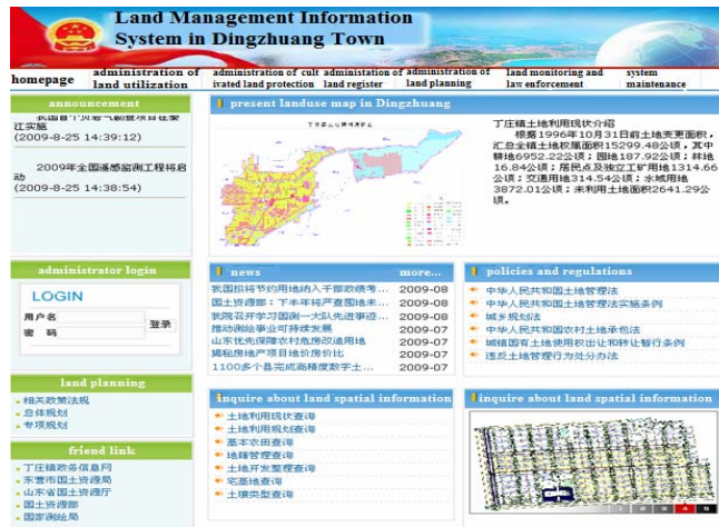
Fig. 2. Host interface of the system

This spatial information inquiry function contains four modules: layer demonstration; Hawkeye; attribute inquiry; inquiry outcome demonstration. In addition, there are other human-friendly functions like enlargement, shrinking, measurement, whole layer demonstration and so on. The first feature is that the users can inquire all kinds of land data information by clicking graphs, such as land plot basic information, land conversion information, basic geographic information and so on. The second feature is that users can inquire spatial graphic information by inputting conditions and also make inquiries by selecting land categories, the administration it belongs to and administrative region.