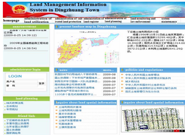
Fig. 2. Host interface of the system

This spatial information inquiry function contains four modules: layer demonstration; Hawkeye; attribute inquiry; inquiry outcome demonstration. In addition, there are other human-friendly functions like enlargement, shrinking, measurement, whole layer demonstration and so on. The first feature is that the users can inquire all kinds of land data information by clicking graphs, such as land plot basic information, land conversion information, basic geographic information and so on. The second feature is that users can inquire spatial graphic information by inputting conditions and also make inquiries by selecting land categories, the administration it belongs to and administrative region.