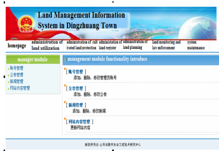
Fig. 5. System maintenance module interface