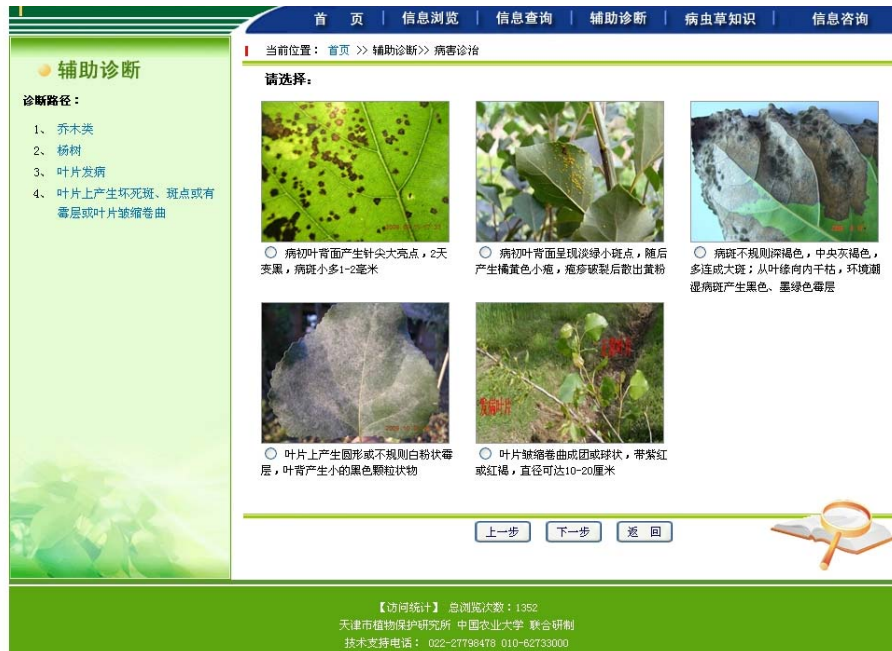
Fig.2: The diagnosis page of TPPADS