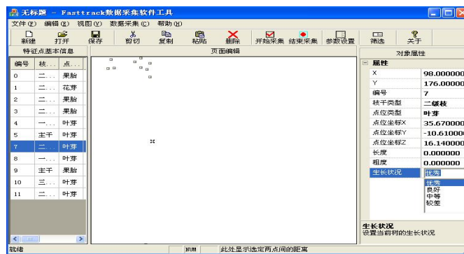
Fig. 5. the interface of collecting software

The figure 5 is the interface of collecting software.