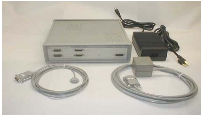
Fig. 1. the Fastrack measuring equipment

tracking instrument and the self-developed data acquisition software. The electromagnetic tracking instrument of our system is Fastrack which is developed by the Polhemus Corporation in the United States, as Figure 1 shown. Fastrack has always been considered the industry standard of electronic positioning during the last ten years. It provides the perfect solution for the position/orientation measurement and its Orientation tracker can accurately calculate the micro receiver's the orientation when it moves in space. The device eliminates the potential problems which are happened when it is carrying out dynamic 6 degrees of freedom to measure the position (Cartesian coordinates in the X, Y, Z coordinates) and orientation (azimuth, height and rotation). So it means that Fastrack is the most accurate electromagnetic tracking system. Data acquisition software system can display points' data collected in a graphical way and stored them into the database. Fastrack is connected with computer through the USB interface and is controlled by data acquisition software in computer. By this way, this system can collect Fruit characteristic point coordinate data and display them in graphical way, then store them in Access database.