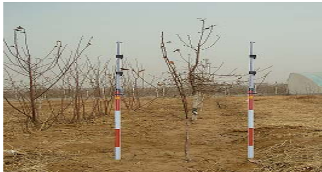
Fig. 2. Fruit samples in the experiment

Fastrack that our experiment used is a measurement system based on the principle of electromagnetic wave and its precision of measurement is affected by External environment and the properties of subjects. For that reason, we must select the appropriate time and place based on the actual situation during the process of collecting data. For example, because the effective measurement range of Fastrack is limited by electromagnetic emission radius, the standard radius of Fastrack's transmitter is 1.2m. On the other hand, the height of the object in this experiment is about 2m. In order to ensure the integrity and accuracy of measurement data, the enhanced transmitting antenna of Fastrack is applied in our measurement. In the measurement process, we placed the transmitting antenna near to the target location of the tree and measured trees in the windless moment of morning or night so as to reduce the impact of external environmental factors and ensure the accuracy of experimental results.