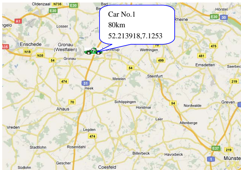
Fig. 4. GPS system monitoring interface sketch