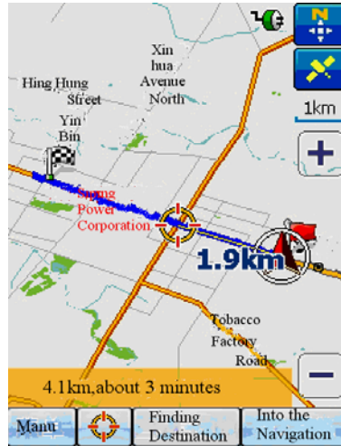
Fig. 2. To start navigation