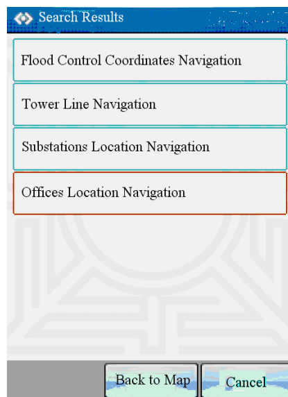
Fig. 1. To preset location information

The locations of transmission towers, substations, offices and so on, are preset in GPS devices, as in Fig. 1. With an electronic map in GPS devices, after positioning by GPS satellites, the route can be automatically calculated by directly clicking on the destination. The route from the start point to the destination can be reasonably planned and tracked, as in Fig. 2.