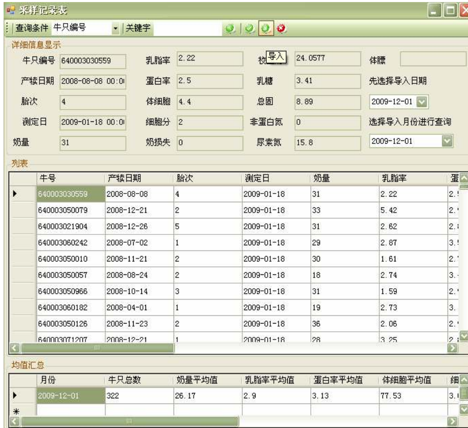
Fig. 2. The result

The users only need to select the import date, click the import button and then the data in Excel file will be imported into the database. The summary and imported information will be shown in the list. Click each cell to show the details. We can also search data by import month as well as other conditions. It is convenient for users to compare data of months and the system can generate charts based on imported basic information, which is a similar function that Excel has.