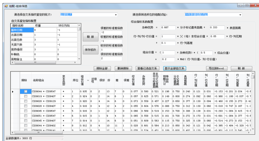
Fig. 3. The interface of hybrid combination order

78 inbred lines were got according to the inbred lines SSR data and phenotypic data screening. For each hybrid combination in this paper, it calculated the heterosis rates using formula 2, and calculated the orthogonal value or reciprocal value using formula 6, and calculated the comprehensive value using formula 8, then sorted the hybrid combinations by the comprehensive value (the sorting interface was shown in Figure 3 below).