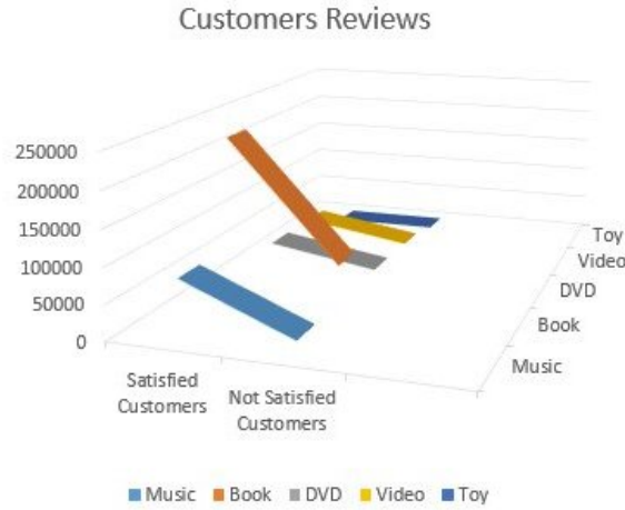
Fig. 2. Customers Reviews

Next Figure 2 illustrates the amount of customers who are satisfied with products of every category. We can observe that the number of satisfied customers is much bigger than the one of not satisfied ones in four out of five categories (regarding category entitled toy, the number is equal to 1 for both category of customers). With these results, one can easily figure out that Amazon customers are loyal to the corresponding company and prefer purchasing products from the abovementioned categories.