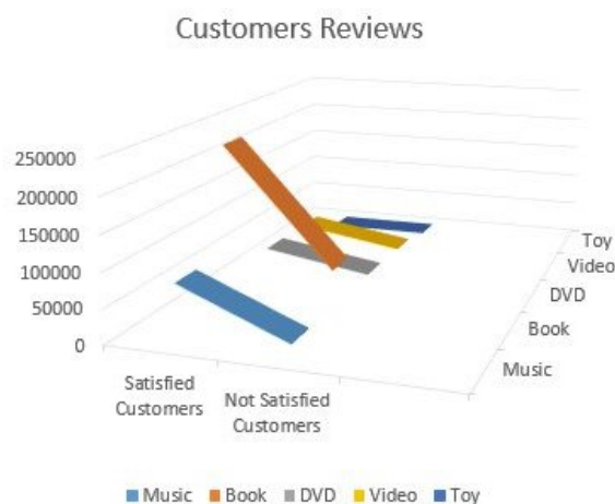
Fig. 2. Customers Reviews

Next Figure 2 illustrates the amount of customers who are satisfied with products of every category. We can observe that the number of satisfied customers is much bigger than the one of not satisfied ones in four out of five categories (regarding category entitled toy, the number is equal to 1 for both category of customers). With these results, one can easily figure out that Amazon customers are loyal to the corresponding company and prefer purchasing products from the abovementioned categories.