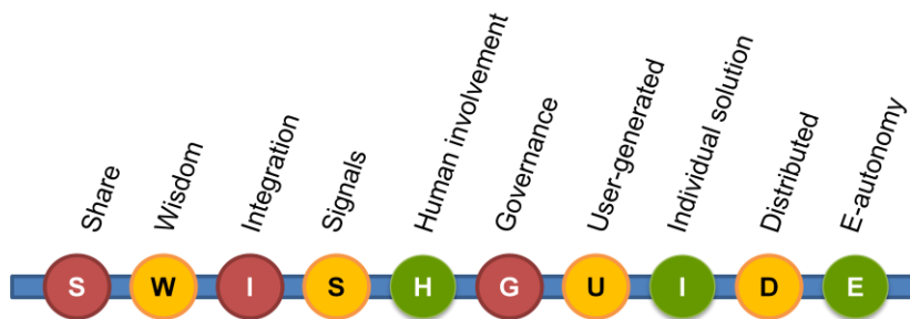
Fig. 1. SWISHGUIDE

Figure 1 demonstrates the SWISHGUIDE categories and the relevant factors of each category. In the rest of this section, the SWISHGUIDE factors will be introduced in more detail.