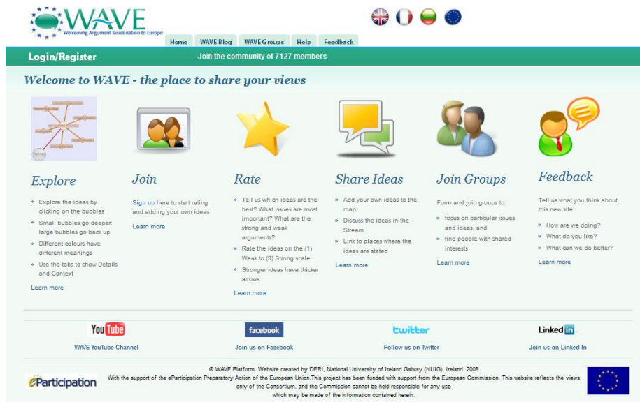
Fig. 1. Platform Home Page (EU pilot)

position, supporting argument, opposing argument, protagonist, etc.) as well as different link types. Adding a new idea involves typing a short description (70 characters maximum) and, if desired, also providing additional details e.g. a larger description (300 characters maximum), text, photos, video (e.g. from YouTube), links etc. Any registered user is able to change any idea on the map. A moderator has been assigned in each map being responsible for editing ideas, deleting irrelevant or offensive contributions, etc.