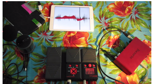
Figure 1: The Voice Reaping Machine.

Despite this relevance, designing for playfulness remains a challenging task, as little knowledge is available for designers to support their choices. For example: in case we want to design a playful NIME, how should we proceed? How can we make sure we are properly addressing playfulness in our design? In other words, what kind of design decisions should one make so that the resulting NIME is playful?