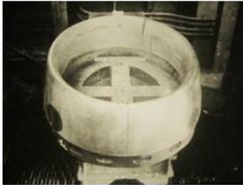
6: The final smoothing cut has been completed and the part is ready for use in forming the inlet sheets.