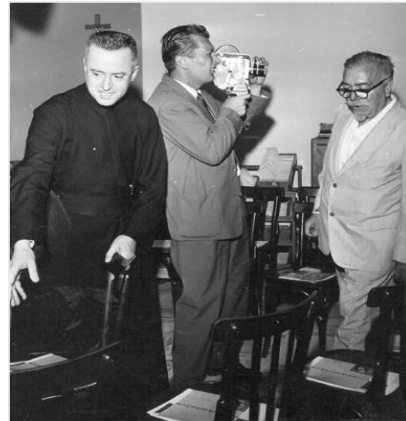
Figure 2 - Together with Norbert Wiener, at CAAL. (1958. Courtesy of CAEL)