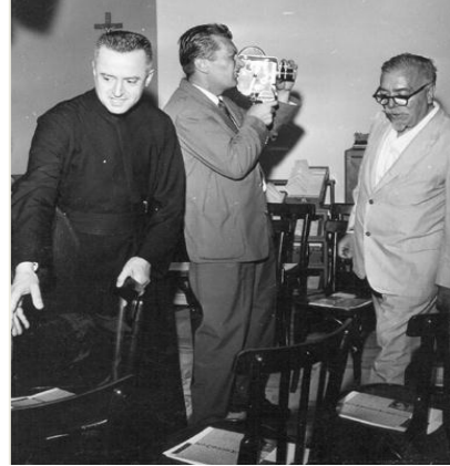
Figure 2 - Together with Norbert Wiener, at CAAL. (1958. Courtesy of CAEL)