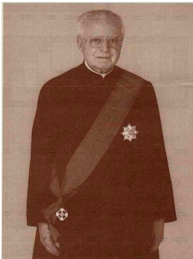
Figure 3 - Roberto Busa decorated as Knight Gran Cross. (Roma, 2005. CAEL Newsletter , Dec. 2006)