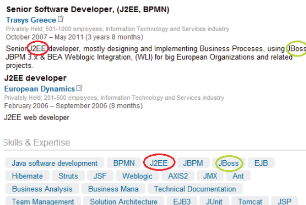
Fig. 3. LinkedIn skills example.

the work experience section (title or description text) of the respective LinkedIn profile. Also, let S be the skills required by the current job position, corresponding to the job position domain and may be found at any level of the hierarchy. If there is an overlap between S and S_1 ( S \cap S_1 \neq \emptyset ), the past job position E_1 is regarded as relevant and thus is taken into account in the relevant job experience calculations.