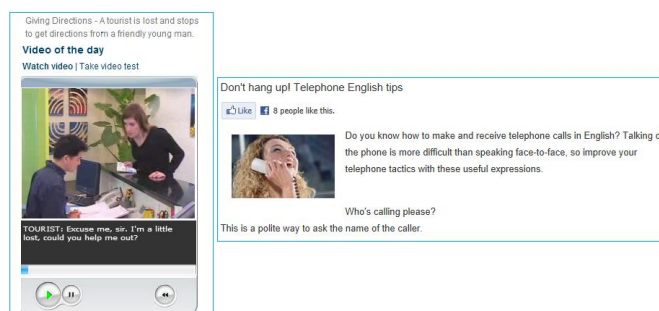
Fig. 4. (a) Video to learn Directions in English and (b) Article to learn Social Protocols .

Next, the researcher analyzed the degree of cultural approximation promoted by selected interactive resources. We saw that the articles were being used to contrast two cultures with examples and explanations (guided tour visitor metaphor); videos typically sought to immerse students in the foreign culture (foreigner without translator metaphor); and quizzes and lessons led students directly into the foreign culture's context, providing them with linguistic support (foreigner with translator metaphor).