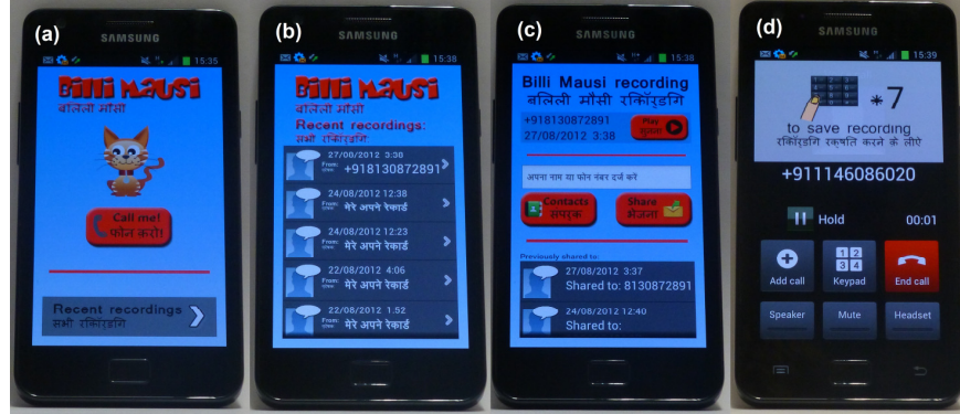
Figure 1 : Screenshots of the Android application: a) home screen, b) list of recordings, c) single recording selected, d) screen during the phone call.

To access a link, a feature phone user needs to dial the phone number embedded in the link and enter a numeric code (also embedded in the link) when prompted. When using the smartphone application the process is seamless and it requires only a tap from the user to access the link. On link access, the voice application fetches and plays the corresponding content and continues with the regular voice application interaction (i.e., the caller can record and share more such recordings).