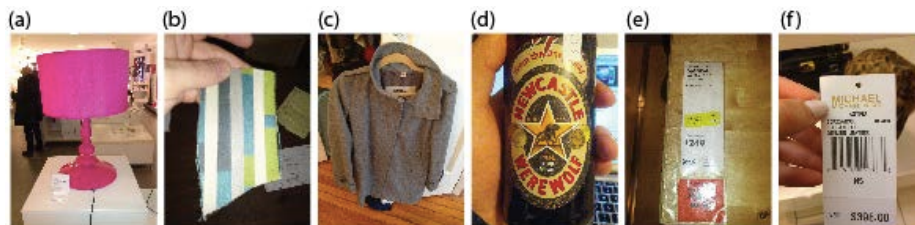
Fig.3. Examples of shopping photos

Physical Products: Taking a photo of the actual product was most common, with 54% of photos showing the full product (Figure 3a), and an additional 12% showing a partial product (Figure 3b) - often a close-up focusing on a specific aspect of the product, such as the texture of a scarf. Furthermore, taking a photo of a product already owned accounted for 16% of photos. (Figure 3c)