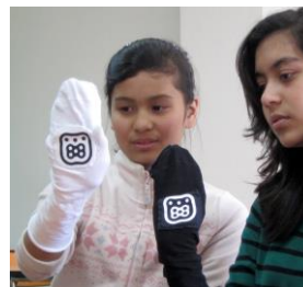
Fig. 2. The sock puppets.

We based our design on the natural curiosity and inventiveness of children [12,3] and on the malleability of flexible tangible objects such as sock puppets [10,2]. We strove to make the visual design of the avatars and the activities they perform as universal as possible so any child will be able to relate to them.