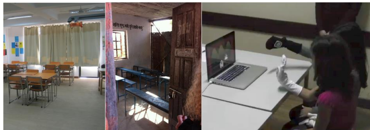
Fig. 3. The three schools in which the studies were conducted.

In all schools the school selected the participating students and no remuneration was provided to either the school or the students.