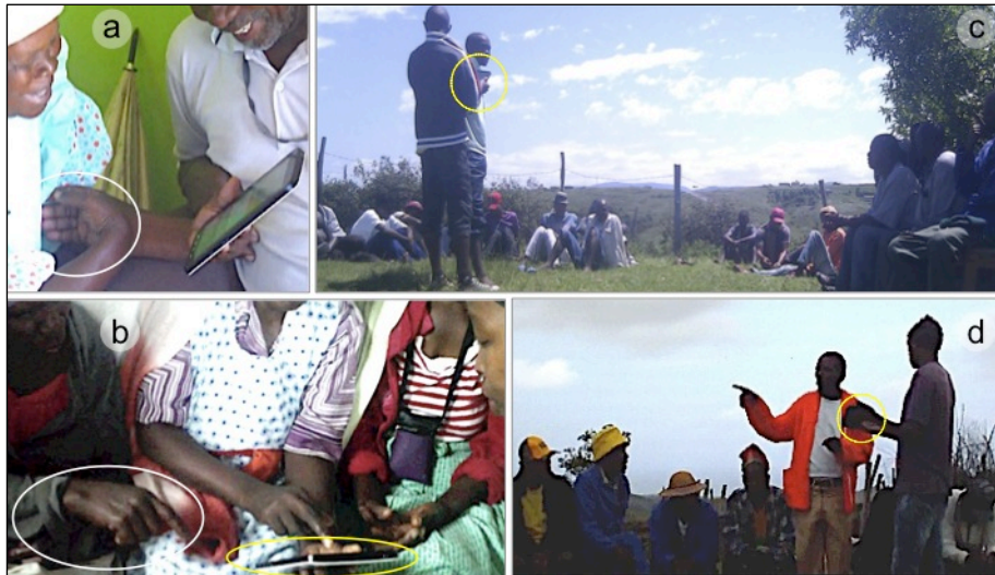
Fig. 3. Subheadmen (a) and older and younger women (b) gestured (white circle) as they interacted and assisted each other in workshops on the AR. Men carry the tablet (yellow circles) to record community and Tribal Authority members speaking in meetings (c, d).

The AR orders profiles alphabetically by first name (Fig. 2a) but people found their accounts, or other users, more easily using photos. This is partly because nearly 50% of female first names start with ‘N’ (50% of male names start with ‘S’, ‘M’ or ‘A’). The vertical display of alphabetically ordered photos (Fig. 2a) also affects other meanings. For instance, the Headman said that a photo directly above his own connoted disrespect as it depicted a young man using a rap-style gesture “over” his head.