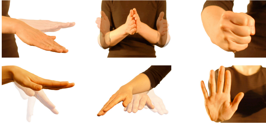
Fig. 2. Reduced Gesture Set. Upper row from left: Slow Down, Clap and Fist. Lower row from left: Go Away, Stroke and Stop.

To reduce the initial set, we conducted a study involving possible end users (five participants, two female) in the second step. For each gesture, they received detailed descriptions, performed the corresponding movement and were interviewed about their subjective meaning. Using this information, we eliminated ambiguous gestures, resulting in a set of 18 gestures, each of them having a unique interpretation.