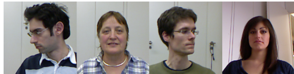
Figure 3: Example frames of the Biwi head-pose dataset .

(yaw), and [-20^\circ, 20^\circ] (roll). Fig. 4 shows examples of the synthetic images generated.