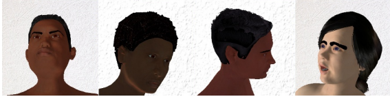
Figure 4: Example frames of our synthetic head-pose dataset.

head with uniformly distributed angles. To ensure robustness during training, each generated image has a randomly selected lighting position and color for the OpenGL engine lighting system. Fig. 4 shows examples of the synthetic images generated.