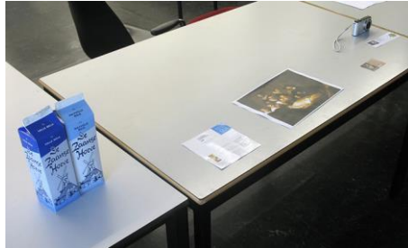
Fig. 1. Props used for the five tasks the participants had to perform.

and Android ‘markets’. Also the means of interaction is rather unfamiliar to the broad public relying on the camera rather than entering information with buttons and touch. In this sense, an evaluation based on the video prototype is practically identical (as far as the users are concerned) with the situations in which video prototypes are evaluated as part of an actual design process.