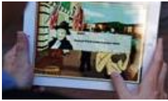
Fig. 1. Non-player character

Each dyad of participants was randomly assigned to one of the two conditions. In the experimental condition, students were taken to the Singapore River to complete their session (see Figure 3). A moderator was assigned to accompany each dyad of students. After briefly introducing the game, the moderator started the game and gave each dyad an iPad. The 18 dyads of participants in the control condition completed their session in a classroom in their school. After completing the game, each participant was asked to complete two paper-and-pencil questionnaires. Then, researchers bought each participant a meal, and asked them not to discuss the experiment with others.