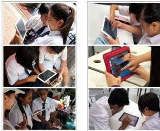
Fig. 3. Outdoor AR players vs. indoor non-AR players