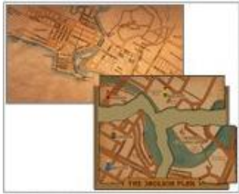
Fig. 2. Real artifact and game maps