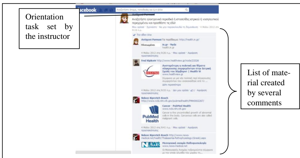
Fig. 1. Screenshot of social brainstorming in Facebook group.

forward, social constructionism assumes that learners can socially exchange “germs” or “seeds”, throughout the brainstorming phase. In the framework of social constructionism, learners interact and exchange material throughout social communication channels. Facebook has been used as a tool for listing resources related to a specific topic. As it is shown in figure 1, an orientation task has been set by the instructor on Facebook requesting from students to search for material related to a specific topic. Participants have been listing related material by posting comments with material related to the specific topic.