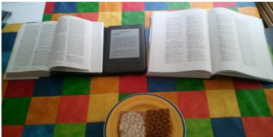
Figure 1: Integrating the e-book into an established morning routine of studying the bible in English (left) and Greek (centre) with the help of a Greek dictionary (right).

Some participants, however, came by their devices more reluctantly, sometimes being given them as presents or being given older devices that had been replaced by newer models. As p9, said: I didn't ask for it, my husband got it for me as a present. I was resistant to it because I like books, the feel of them, the variety of them, and that hasn't stopped through having an e-book, it has just supplemented it. In this instance, we can see some concern that something might be lost through the transition from physical to e-books. To p12, on the other hand, receiving a device was a revelation: because I've not really read much for a long time because of the slight dyslexia [] I thought I can't imagine it's going to make that much of a difference but it really has; [] I'd say that I definitely be reading more, it just makes things more accessible for me really and I enjoy it.