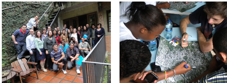
Fig.2 Workshop participant training session (left), youths at workshop in Rio de Janeiro (right).

The Youth Mapping project involved a group of 111 adolescent (from 11 to 18), community thought-leaders, and local authorities in mapping environmental risks in target communities. The project implementation was carried out in a two-step approach: an initial session to train key stakeholders (see fig.2 on the left) and secondary workshops with local youths for content generation (see fig. 2 on the right).