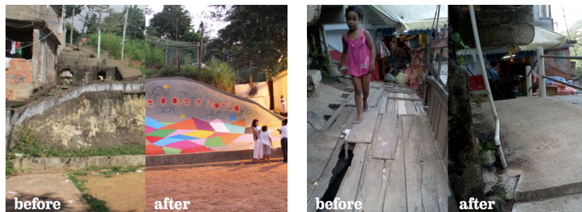
Fig.3 Improvements made to communities, as informed by the Youth Mapping project.

To assess the workshops, youth and instructors were interviewed according to prepared questionnaires. We interviewed 6 youths (3 males and 3 females) and 2 instructors. Technically, the platform functioned well. At times, a slow 3G connection prevented casts from uploading properly, but the information architecture of the Open Locast platform was designed to cope with this issue.