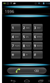
Fig. 2. The telephone app with the CACs introduced to improve its usability.

In order to choose the better locations of the CACs, we identified the main interaction areas: the status bar (battery indicator, mobile network, time, etc.); numeric display area (where the number the user is dialing is visible), numeric keyboard (to dial the number), call and delete buttons; navigation bar (home and back buttons). Then we placed four CACs to separate these five areas. The uppermost and the lowest were associated with a sound both to highlight the boundaries of the part of the UI strictly related to the dial pad, and at the same time, marking the status -- at the top -- and the navigation -- at the bottom -- bars. These hints helped avoid accidentally pressing of one of the smartphone's built-in soft-keys that compose the status and the navigation bars. The intermediate cues were placed to highlight the other areas: the beginning and end of the numeric keyboard is marked by means of a vibrating pattern, thus making it easy to detect also the numeric display area and the call and delete buttons.