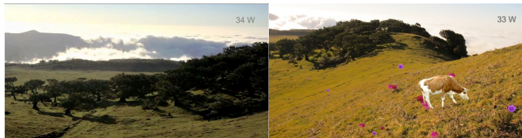
Fig 1. Screenshot of the application used in the pilot. At left there’s the main view of the forest, the consumption is mapped as the movement of the clouds in the background. At right there is the landscape with elements added based on the appliances used.

Three of the four families interviewed suggested that the concrete data provided by the first two versions should be merged with the aesthetic pleasure of the natural landscape shared this view.