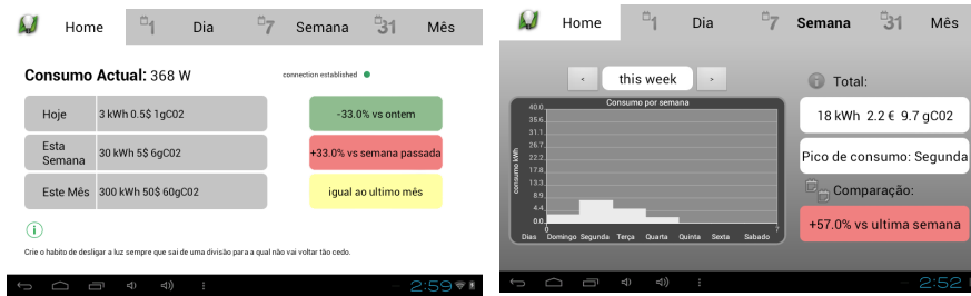
Fig. 6. Left: Home screen of the system. Right: Tab with the consumption of the current week.