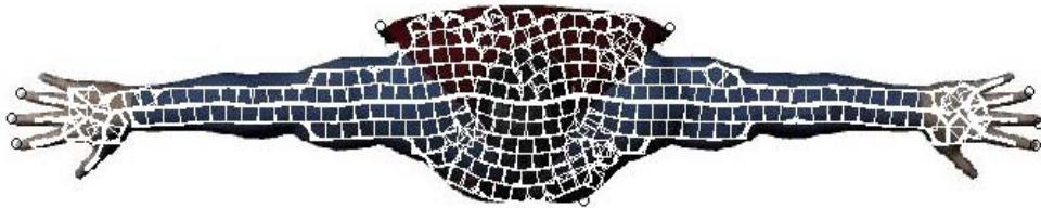
Figure 1 Watermarked blocks arranged across the Eulerian tours around the skeleton of the Superman top view.

A robust skeleton of each object is initially extracted in a vector form. To introduce enhanced noise resistance to the extracted skeleton, we use the Global-Local transformation [2] to map the noise contour back to a smoothed version. Starting then from the skeleton endpoints (marked as small circles in the images below), the pseudorandom watermark sequence is embedded in the DCT domain of the blocks along the skeleton's Eulerian tour. When the first tour is completed the Eulerian tour is extended outwards, in consecutive layers towards the object's boundary until the watermark sequence is spread to the whole object. During watermark detection, initially the skeleton of the candidate object is extracted and the potentially watermarked blocks that are located along the extended Eulerian tour are matched against the respective blocks around the initial skeleton. Only tours starting from the skeleton endpoints are examined. The success of the method stems from the fact that based on the Global-Local transformation, the robust skeleton is extracted from a smooth version of the original contour that retains certain metric information.