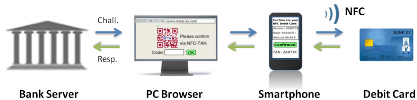
Fig. 1. Basic steps of the NFC-TAN method.

However, academic approval of security is not the only success factor for online banking methods [25, 32]. Other important factors are usability, system integration complexity, trust, bank-internal policies or business strategies, external regulations, and - maybe most importantly - costs and benefits. That is why