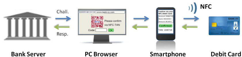
Fig. 1. Basic steps of the NFC-TAN method.

However, academic approval of security is not the only success factor for online banking methods [25, 32]. Other important factors are usability, system integration complexity, trust, bank-internal policies or business strategies, external regulations, and - maybe most importantly - costs and benefits. That is why