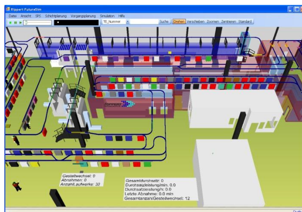
Fig. 2. - Operating 3D model of an Rippert powder coating system

The main administration and order data is stored in the ERP-system. The pilot project ERP-systems were using common databases such as MS SQL and Oracle. In order to stay platform neutral the application connects this Administration level with the production MES level using stored procedure links implemented in C#. The goal was to implement a generic interface in order to reuse the connection strings in further projects with different ERP-systems, databases and PLC-applications.. More implementation work was required at the APS-level. The 3D simulation models used for system design and optimization during pre-sales and engineering had to be supplemented with PLC information representing the real shop-floor system. To monitor using a 3D model requires a unique and realistic representation of each Power and Free section and production process stage.