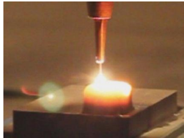
Fig. 2. Process of laser wire deposition of a metal volume

Fig. 2 shows a typical laser wire cladding process during a multiple-track deposition. The process shows a stable behaviour with extremely low emissions of splashes and dust, compared to powder-based processes. The integrated on-line temperature regulation keeps the temperature of the material on a constant level during the whole manufacturing duration.