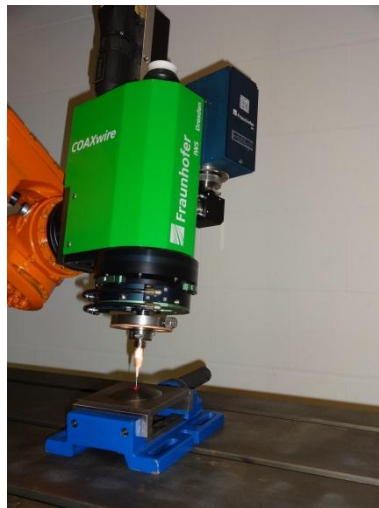
Fig. 1. Laser processing optic with coaxial wire supply

The wire is fed to the processing head via a hose package that contains wire feeder, coolant supply and protection gas delivery. Wire feeders from all major manufacturers can be easily adapted to this setup and are selected based on wire type, feed rate, and operation mode. Typical wire diameters range from 0.8 to 1.2 mm. However, the new technology is principally also suitable for finer wires of about 300 \mu\text{m} in diameter. The wires can be used in cold- and hot-wire setups to implement energy source combinations. The new laser wire processing head is useful for large-area claddings as well as additive multilayer depositions to build three-dimensional metallic structures.