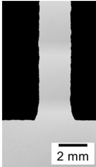
Fig. 3. Cross-section of a laser generated wall of INCONEL718