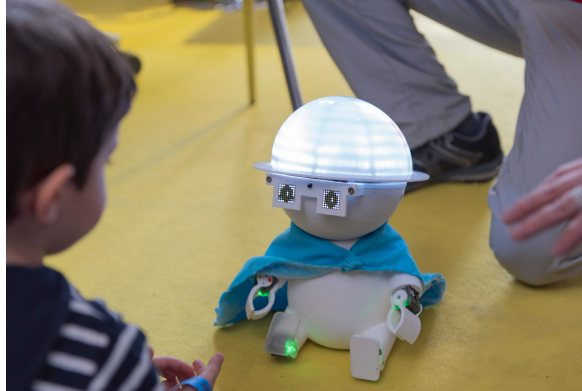
Figure 1: Teegi displays brain activity in real time by means of electroencephalography. It can be used to explain to novices or to children how the brain works.

an easy, engaging and informative way. Indeed, EEG measures the brain activity under the form of electrical currents, through a set of electrodes placed on the scalp and connected to an amplifier (Figure 2). EEG is widely used in medicine for diagnostic purposes and is also increasingly explored in the field of Brain-Computer Interfaces (BCI). BCIs enable a user to send input commands to interactive systems without any physical motor activities or to monitor brain states [4, 1]. For instance, a BCI can enable a user to move a cursor to the left or right of a computer screen by imagining left or right hand movements respectively.