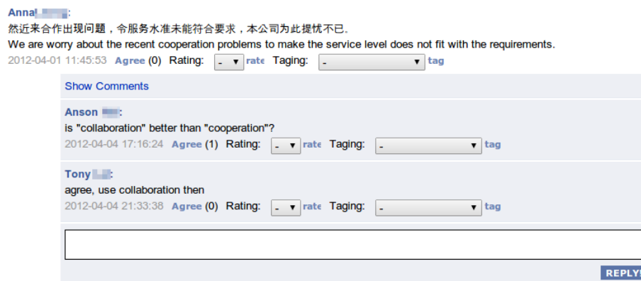
Fig. 3. TransWiki discussion

In online collaborative translation, discussions play an important role in helping move the collective translation work forward by discussing the suitable way to translate a given text. In teaching translation, instructors need ways to assess not only the outcome of the translation, i.e. the target text, but also the process which led up to this outcome, which is recorded in the online discussion. To facilitate assessment of discussions, we have extended the instructor's view of the discussion forum with two additional functions: a rating function and a tagging function. Ratings allow the instructor to indicate how significant a contribution the given discussion post has made and are on a 5-point Likert scale (-2, -1, 0, 1, 2). Tags indicate the type of contribution made, and can be one of the following nine options: Informative, Argumentative, Evaluative, Elicitive, Responsive, Confirmation, Directive, Off task, or Off task technical. Rating and tagging together thus capture both a quantitative as well as a qualitative assessment of each discussion statement.